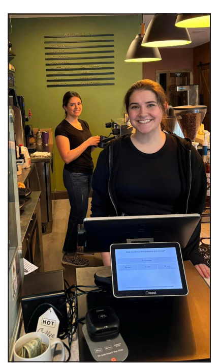
The E.A.T. crew

will collect taxes for the entirety of the Marcellus and OCS Districts, including those areas outside the Town of Onondaga. The change will reduce these districts' collection admin costs while adding revenue for the Town.